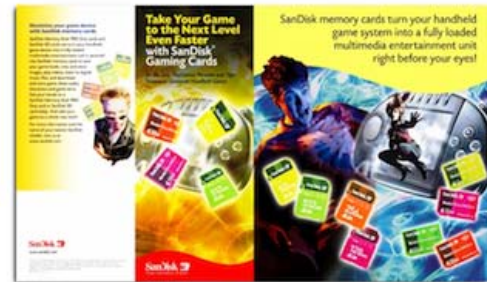
SanDisk Gaming Brochure