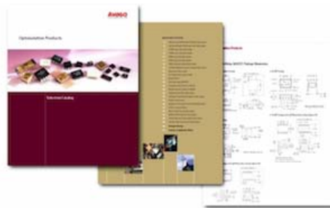
Avago Product Catalog