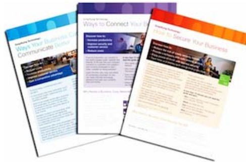
Cisco "Basics of" Brochures