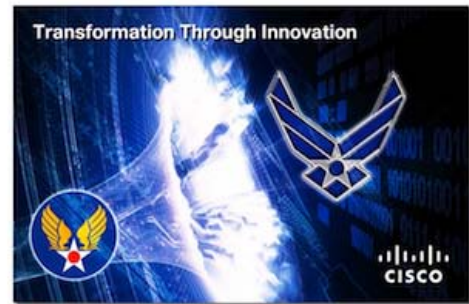
U.S. Air Force Banner