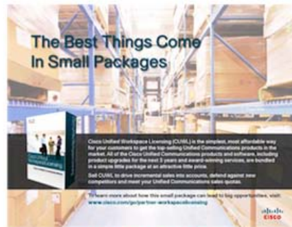
Cisco UWL Partner Poster