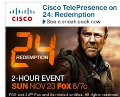
Cisco 24 Prequel 300x250 Flash banner